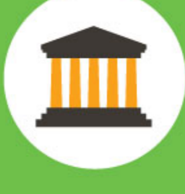
Regional and provincial institutions that support nonprofits