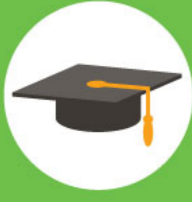
Colleges and universities including students and researchers