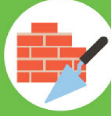
Social enterprise developers